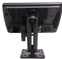
Bracket RAM 38*30mm ball head