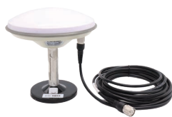
RTK Mushroom Antenna (TNC Connector)