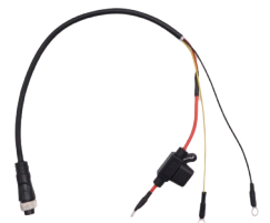
ACC Power Cord