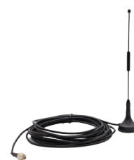
Data Radio External Suction Cup Antenna