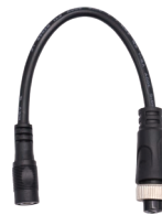
DC Patch Cord